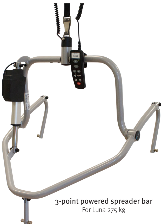
3-point powered spreader bar For Luna 275 kg