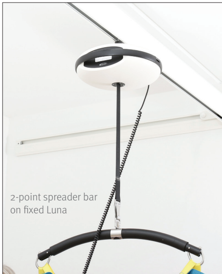
2-point spreader bar on fixed Luna