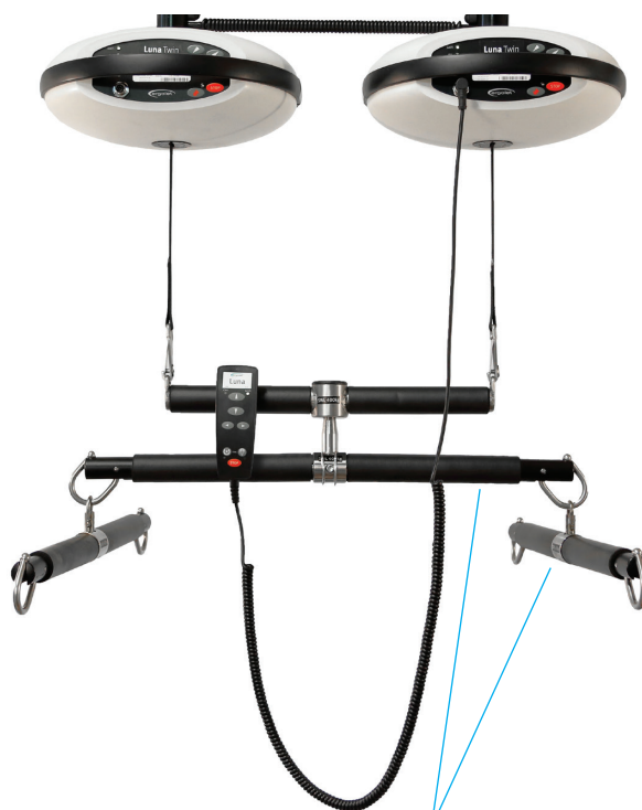
Spreader bars for Luna Twin, 400 kg Løftebøjle og fleksible side-løftebøjler Available in 360/480/580 mm