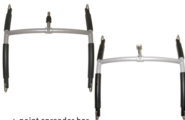
4-point spreader bar For bayonet or strap