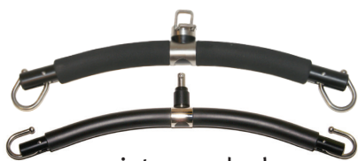
2-point spreader bar For bayonet or strap Available in 360/480/580 mm