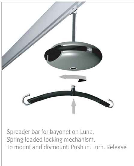
Spreader bar for bayonet on Luna. Spring loaded locking mechanism. To mount and dismount: Push in. Turn. Release.